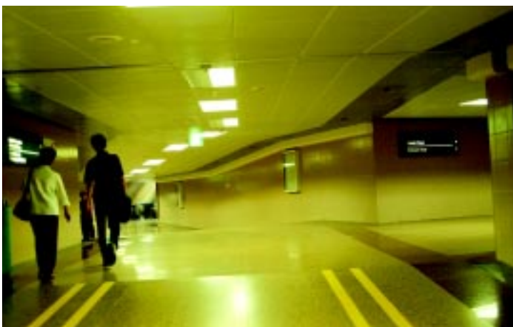
Pedestrian underpasses can be designed with good visibility and clear sight lines