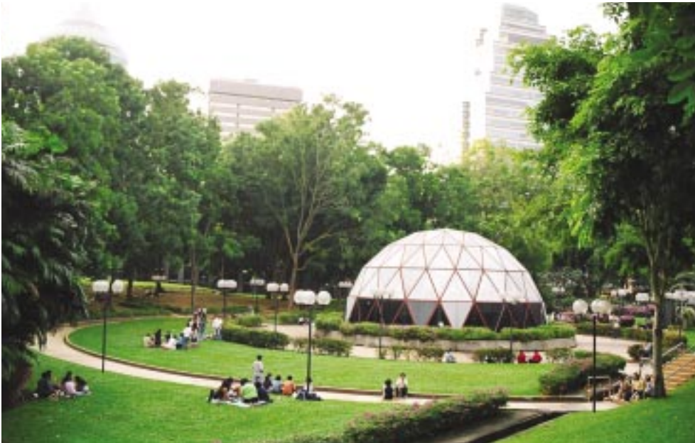
Open space within the central business district can be used for various activities

Activity generators are uses or facilities that attract people, create activities and add life to the street or space and thus help reduce the opportunities for crime. Activity generators include everything from increasing recreational facilities in a park, to placing housing in the central business district or adding a restaurant to an office building. They can be provided on a small scale or be added as supporting land use, or intensifying a particular use.