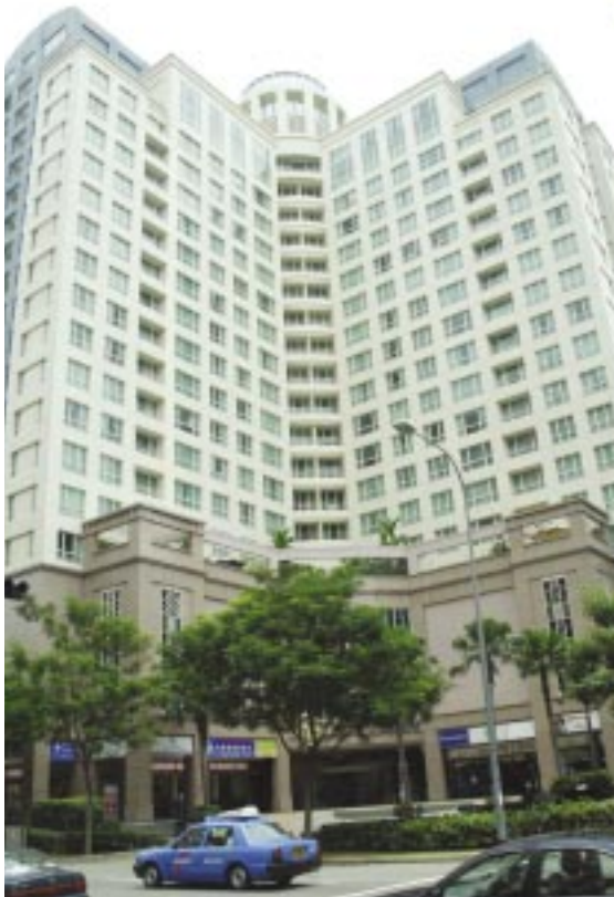
Compatible mixed uses can encourage activity, natural surveillance and contact among people

A balanced land use mix is important for environmental, economic, aesthetic and safety reasons. Mixed uses must be compatible with one another and with what the community needs. For a residential development, a number of uses can be included by having a main street, a town square or park, prominent civic buildings and above all the ability of residents to walk to the place of work, to day care centres and to shops. The social value of frequenting local businesses provides a sense of security and safety as the local business people “watch” the street. Generally, any design concept that encourages a land use mix will provide more interaction and a safer place.