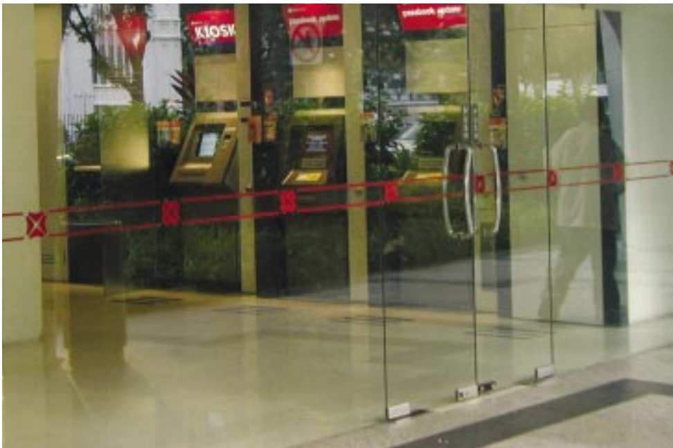
Banking facilities can be located near pedestrian activities to reduce sense of isolation

Most people feel insecure in isolated areas especially if people judge that signs of distress or yelling will not be seen or heard. People may shy away from isolated areas and in turn such places could be perceived to be even more unsafe. Natural surveillance from adjoining commercial and residential buildings helps mitigate the sense of isolation, as does planning or programming activities for a greater intensity and variety of use. Surveillance by the police and other security personnel to see all places at all times is not practical, nor economical. Some dangerous or isolated areas may need formal surveillance in the form of security hardware, i.e. audio and monitoring systems. Aside from its cost, the hardware must be watched efficiently and attentively by staff trained for emergencies.